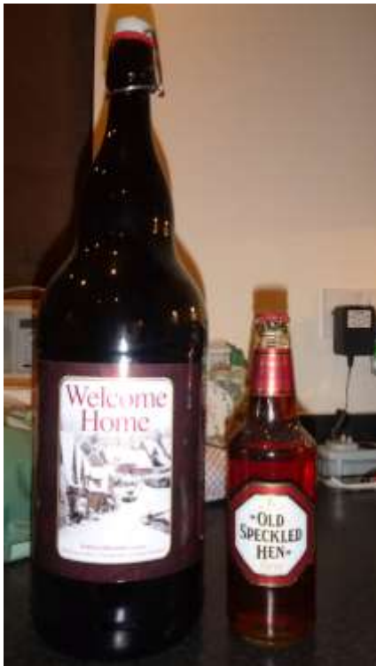
A 'small' bottle of beer – first prize in the raffle draw won by IP

A raffle draw was held at the start of the evening (boring bits were done first) - first prize was won by IP. The QH3 thanked all hashers for their support over the past year and paid for all the evening meals!