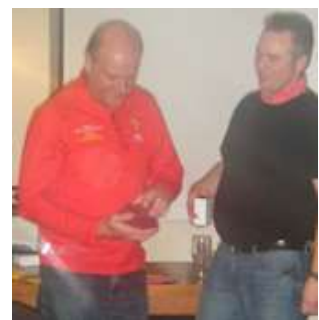
Durex receiving the award for 'Best Director'

Butcher's Dog, 3 trails #830 Keyworth, #844 Hathersage, #854 Lady Bay – all tough ones