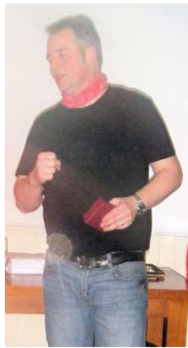
Master of ceremonies and QH3 GM, B*gger