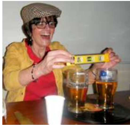
Current Beer Mistress Malteaser with a lot to learn