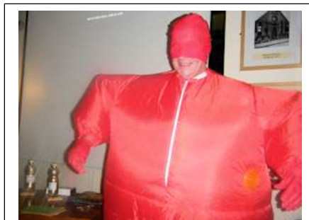
Guest present for best newcomer – Big Fat Red Man